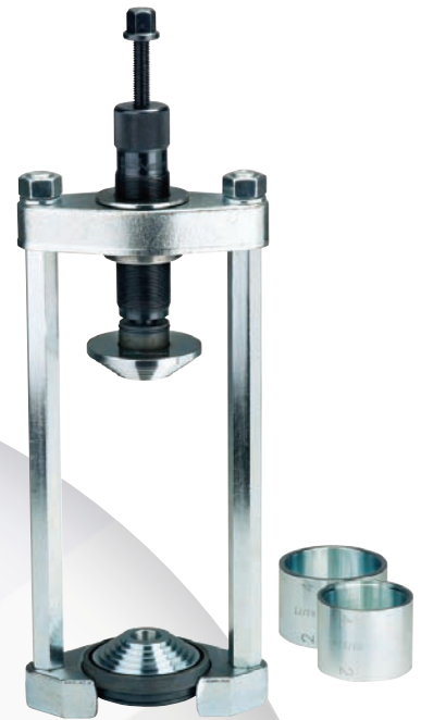
18780100 fitted to Universal Press Frame for use with Press & Pull Sleeve Kits