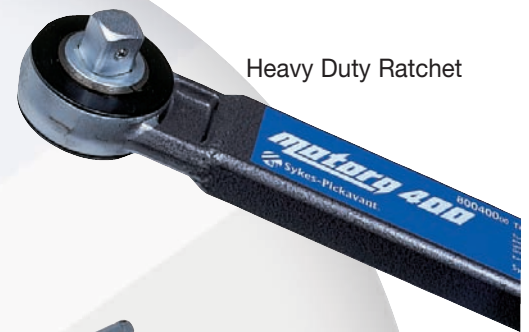
Heavy Duty Ratchet